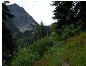
On the way to Twisp Pass

Autumn colors make Twisp Pass a lovely hike this time of year. The first half-mile parallels the forest road, but then you enter the Lake Chelan-Sawtooth Wilderness. This 151,435-acre wilderness stretches from Lake Chelan's northeastern shore across the Sawtooth Range to the Twisp River valley.