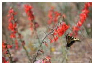
Flowers on Lookout Mountain, earlier this year

The Lookout Mountain trail, outside of Twisp, is a classic Methow Valley hike to an abandoned fire lookout with spectacular, 360-degree views of the Sawtooth Range, Mt. Gardner, Tiffany, Bald, Methow Valley, and Columbia Plateau.