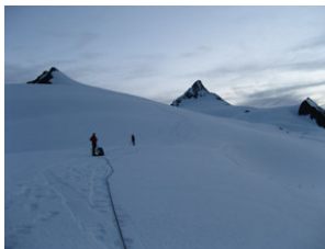
Early morning on the Sulphide Glacier

The only thing I could see at 4:30 a.m. was the patch of snow illuminated by my headlamp and the intermittent glow of Nate and Chris's lights as we left our warm sleeping bags behind. The three of us were in a rope team on the Sulphide Glacier attempting to summit Mount Shuksan, a jagged alpine peak east of Mount Baker in North Cascades National Park.