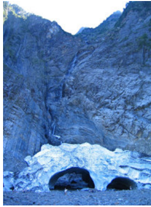
Big Four Ice Caves

Learn more about this hike by clicking here.