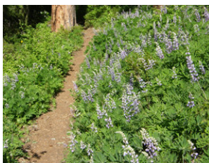
Ingalls Creek trail & spring flowers

Learn more about this hike by clicking here.