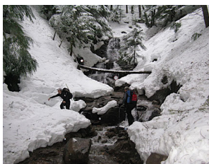
Creek crossing on the way to Olallie Lake

snowy surrounds to him or herself. The journey to the lakes takes the intrepid snowshoer past a number of creeks, including a beautiful waterfall stemming from the flanks of Granite Mountain.